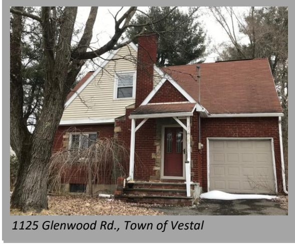
1125 Glenwood Rd., Town of Vestal

project costs of all three properties are $480,000 and the sales to qualified families should take place prior to the end of 2020.