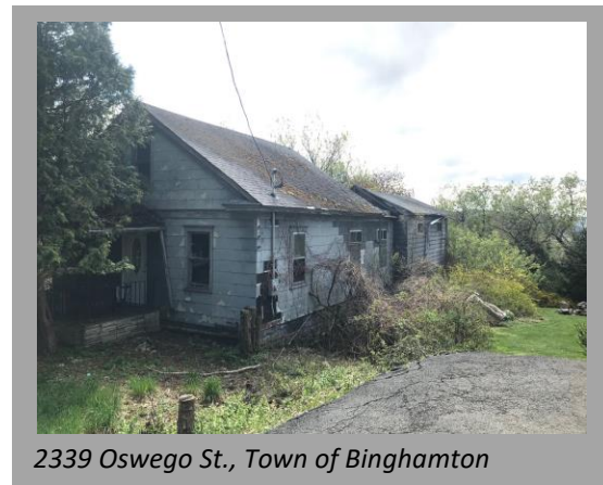
2339 Oswego St., Town of Binghamton

Working with the Town of Binghamton, the BCLBC identified 3492 Margery Street as a demolition project within the Town. The property, a two-family home, was vacant for over six years and the Town condemned the property based on unsafe conditions. The property was a significant eyesore in the neighborhood and was demolished in April. Later in the year, the BCLBC identified 2339 Oswego Street as a demolition project with the assistance from Town Code Enforcement. Due to eight years of vacancy and neglect, portions of the structure had collapsed and the BCLBC decided to demolish the remaining structure in August. A few months later, the BCLBC sold the vacant lot to an adjacent neighbor through the Land Bank's Side Lot Program