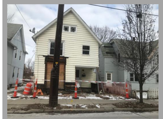
1223 Vestal Ave., City of Binghamton

A large component of the BCLBC's first year of the CRI Round 4 award was our county-wide demolition program. In 2019, the BCLBC, with input from the community and our municipal partners, identified multiple residential properties for demolition. The first wave of demolitions occurred in the City of Binghamton. The properties identified were 21 Milford Street and 1223 Vestal Avenue. 21 Milford Street was a blighted eyesore on the East Side of Binghamton. 1223 Vestal Avenue was a structurally condemned single-family house that had been struck by a car, severely impacting the foundation. The BCLBC demolished both properties in January, removing hazards from the community. With approval from the Board of Directors, both properties were sold to neighbors through the BCLBC's Side Lot program; thereby, placing the properties back on the tax rolls.