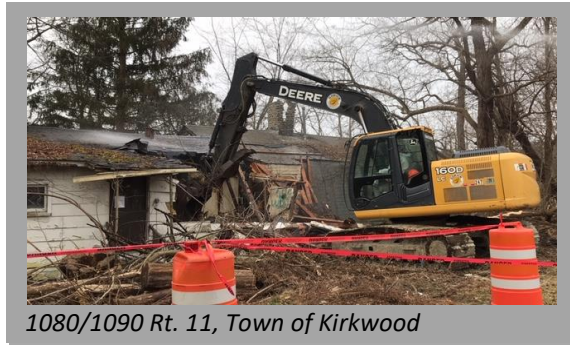
1080/1090 Rt. 11, Town of Kirkwood

1080 and 1090 Route 11 in the Town of Kirkwood were two vacant blighted properties that experienced significant flooding in 2006 and 2011. Both properties had been recipients of numerous code violations and code actions. Town and County officials and residents observed as both properties were demolished in early January. The Town of Kirkwood intends to transform the vacant lots into green space for a small park with river access.