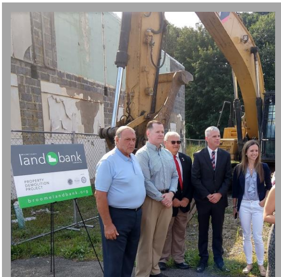
147-151 Front St., Town of Vestal pre-demolition press conference with County, Town and Land Bank Officials