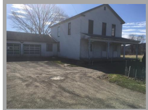
1200 State Rt. 79, Town of Windsor

The BCLBC partnered with Windsor Central School District in March to demolish 1200 State Route 79 in the Town of Windsor. The structure was a vacant farmhouse and sits on 6.7 acres of land across the street from Windsor High School. The school district will use the property for the High School’s “Ag in the Classroom” program which will allow students hands-on experience in agriculture. The total project cost was $55,000. The BCLBC contributed $45,500 towards the cost of asbestos abatement and demolition. Keystone Engineering and LCP Group were also partners on the project.